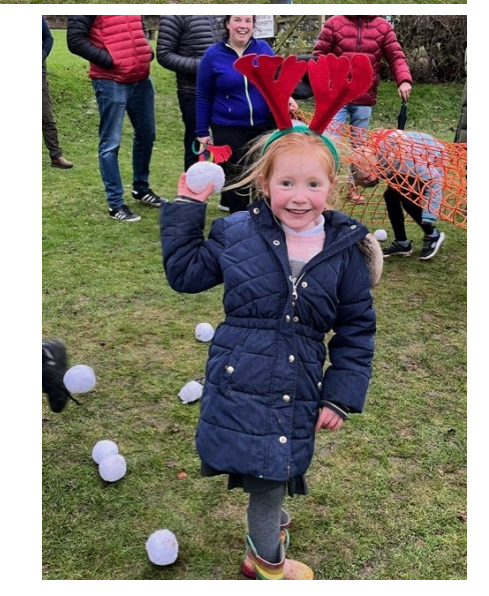
RotaKids Reindeer Cake and Juice Sale