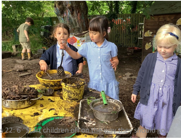
Proverbs 22: 6 "Start children off on the way they should go, and even when they are old they will not turn from it."