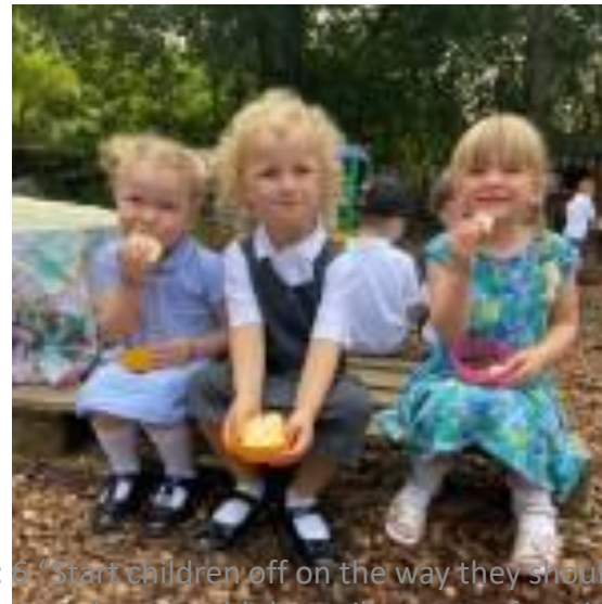
Proverbs 22: 6 "Start children off on the way they should go, and even when they are old they will not turn from it."