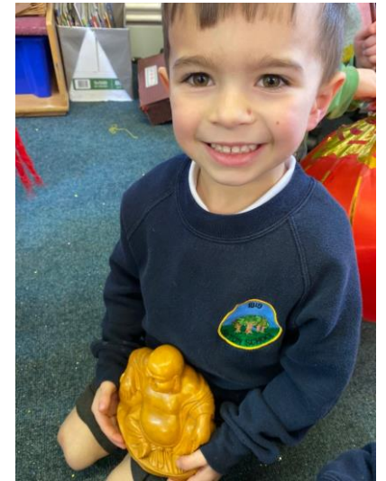
Proverbs 22: 6 "Start children off on the way they should go, and even when they are old they will not turn from it."